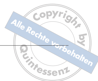
Table 1 Principal and recent studies investigating links between periodontal disease and T2DM